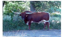
SUPER LUPPA EOT 926